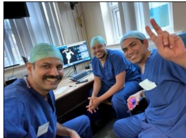
Pre-op clinical discussion with team - morning before surgery