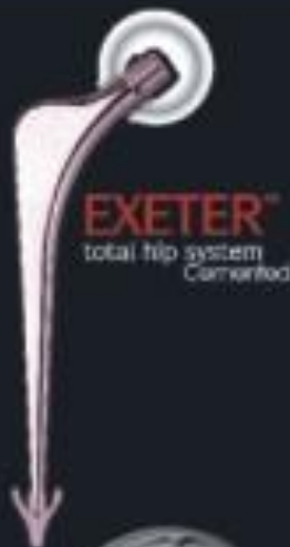
EXETER ™ total hip system Comfort