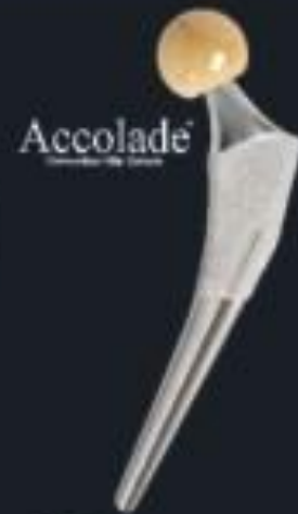
Accolade Total Hip System