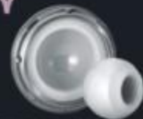
Trident ® Acetabular System