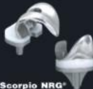
Scorpio NRG ®